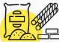
Cement, Steel & Lightweight Construction Blocks (AAC)