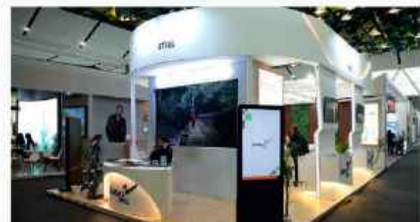
Jindal Steel & Power Ltd