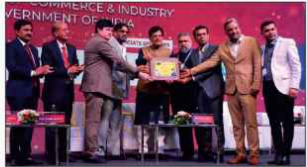
Honoring Shri Piyush Goyal with memento