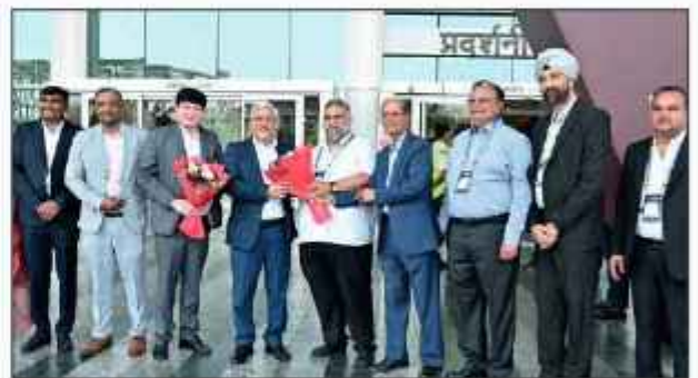
Shri Sunil Barthwal

(Hon'ble Minister of Youth Affairs and Sports and the Minister of Labour and Employment)