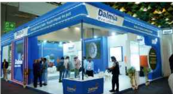
Dalmia Cement (Bharat) Limited