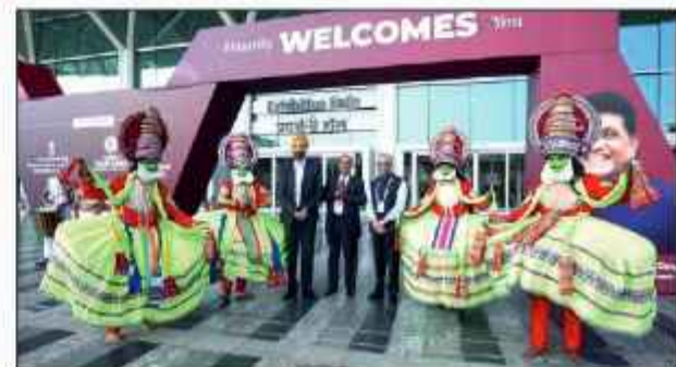
Welcome in traditional way