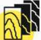
Timber, Plywood, Laminates, Surfaces & Flooring