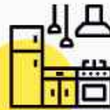
Electronics & HVAC