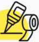
Glue, Tile Adhesives, Grouts & Construction Chemicals