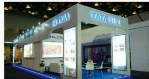
Tata Steel Limited