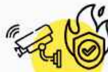
Fire Safety Systems, Surveillance & Access Control Solutions