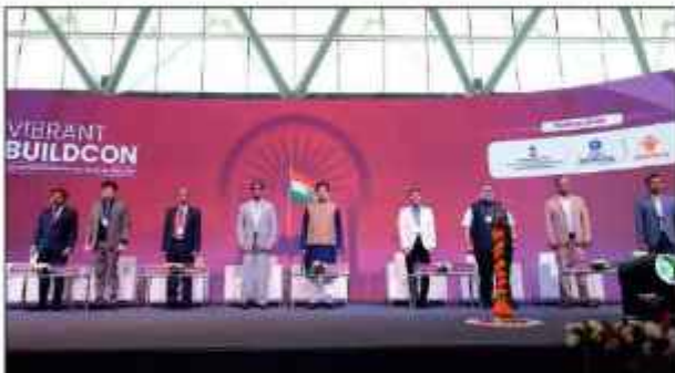
Dignitaries on stage