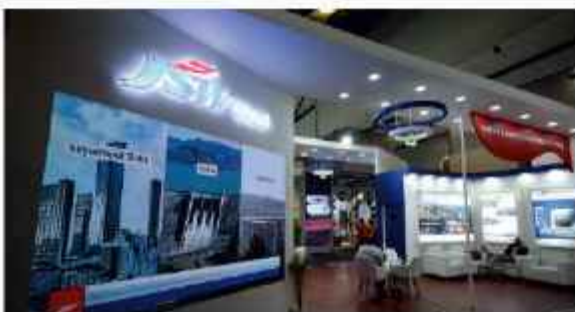
JSW Steel Limited