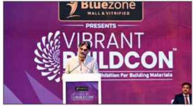
Mr. Suniel Shetty (Actor & Brand Ambassador of Vibrant Buildcon 2025)