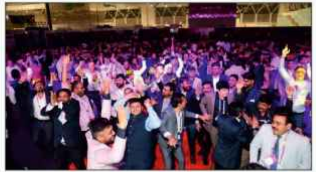
Gala vibes and good times.