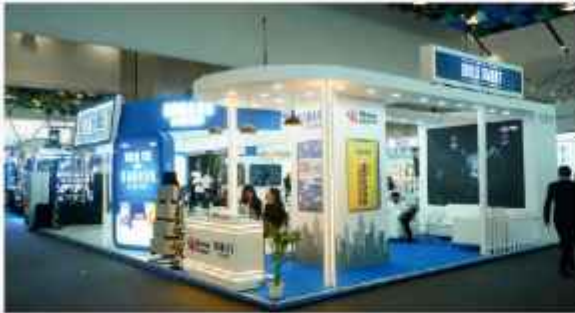
Shree Cement Limited