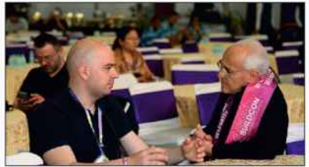
Networking at Gala Dinner