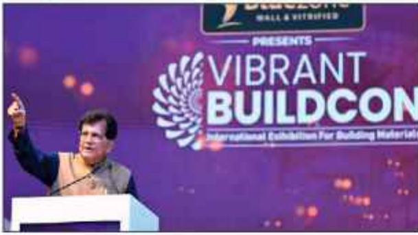
Shri Piyush Goyal (Minister of Commerce and Industry, Government of India)