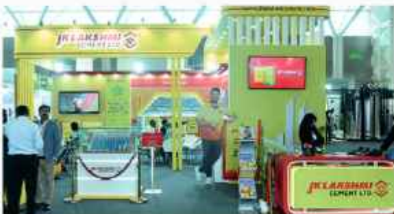
Jk Lakshmi Cement Limited