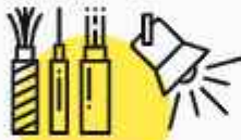
Electrical & Lighting Solutions