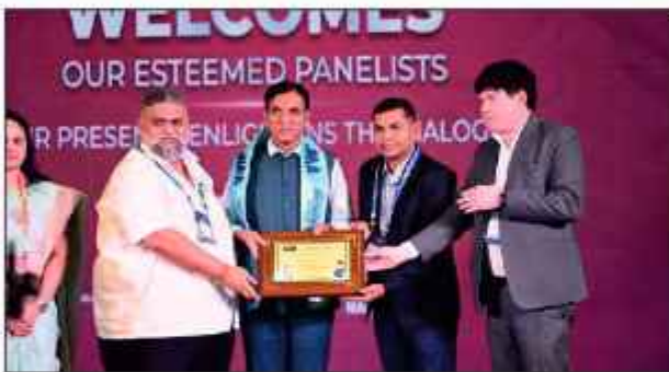
Shri Mansukh Mandaviya

(Hon'ble Minister of Youth Affairs and Sports and the Minister of Labour and Employment)