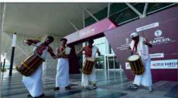
Welcome in traditional way