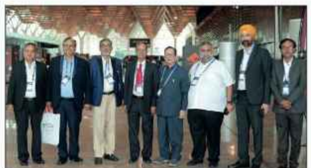
Vibrant Buildcon with Capexil

(Hon'ble Former Minister of State for Agriculture and Farmers Welfare of India)