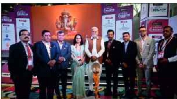
Shri Parshottam Rupala

(Commerce Secretary, Ministry of Commerce, Government of India)