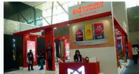
Wonder Cement Ltd