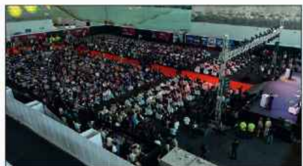
The Participants During Inauguration Ceremony