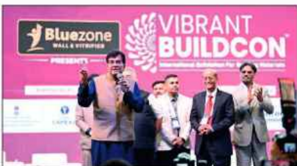
Shri Piyush Goyal addressing Vibrant Buildcon's success