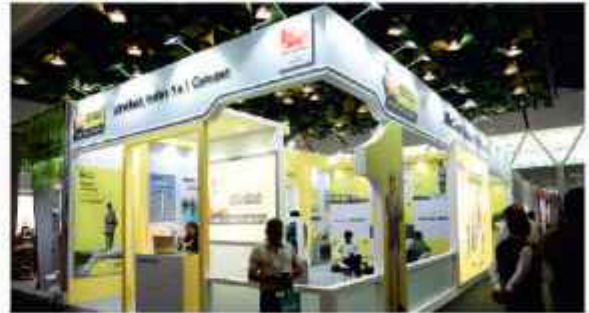
Ultratech Cement Limited