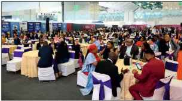
A joyful gathering over a Grand Gala dinner