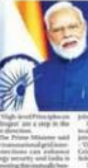
Prime Minister Narendra Modi said G20 Energy Ministers should focus on clean energy transition, but while doing so, they should also ensure that the transition is inclusive and sustainable.

DELHI NEW DELHI, JUNE 17 Prime Minister Narendra Modi said G20 Energy Ministers should focus on clean energy transition, but while doing so, they should also ensure that the transition is inclusive and sustainable. Modi said that the G20 should focus on creating a more inclusive and sustainable world. He said that the G20 should focus on creating a more inclusive and sustainable world.