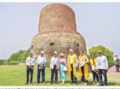
Union External Affairs Minister S. Jaishankar with representatives from various countries participating in G20 meetings, visit the Sarnath in Varanasi on Tuesday.

EXTERNAL Affairs Minister S. Jaishankar along with G20 delegates Tuesday visited the historical Buddhist site of Dhamek Stupa in Sarnath here, officials said. The delegates from different countries have arrived here for the three-day G20 Development Ministers' meeting, which commenced on Sunday. Around 12 km from the ancient temple town of Varanasi, Sarnath is one of the most revered Buddhist pilgrimage centres in the world. The Dhamek Stupa marks the location where Lord Buddha is believed to have delivered his first sermon after attaining enlightenment. It was built in 500 CE to replace an earlier structure constructed by King Ashoka in 249 CE. During their Sarnath visit, the G20 guests also visited other holy places in Sarnath, including Buddhist monuments and the remains of ancient monuments and relics of the Mauryan period.