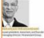
Chairman, National Women's Entrepreneurship Council

Business-led development would be better realised if concerted efforts are made by all in favour of gender-neutral leadership