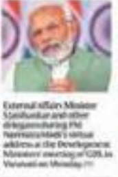
External Affairs Minister S. Jaishankar and other development ministers from 20 countries also participated in the meeting.

DELHI NEW DELHI, JUNE 17 Prime Minister Narendra Modi said development is a "core issue" for the Global South. Modi's remarks came during a meeting of the G20 Development Ministers' meeting in Varanasi on Monday. Prime Minister Narendra Modi addressed the meeting via video link from the "Lal Bahadur Shastri" auditorium in Varanasi. External Affairs Minister S. Jaishankar and other development ministers from 20 countries also participated in the meeting. Modi said that development is not just about economic growth but also about social and environmental progress. He said that the G20 should focus on creating a more inclusive and sustainable world. He said that the G20 should focus on creating a more inclusive and sustainable world. He said that the G20 should focus on creating a more inclusive and sustainable world.