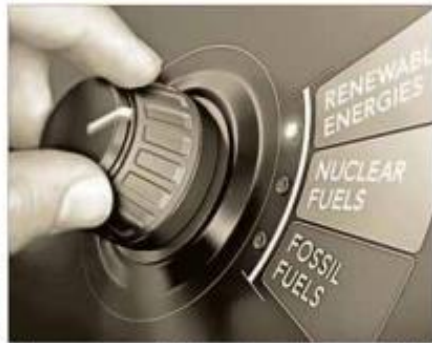
India has emerged as a country with the fastest growing renewable energy capacity globally. This has also made it the most attractive investment destination. These efforts are helping India meet its needs while contributing to global efforts to reduce CO2 emissions.

In the 2022 Climate Change Performance Index, we have been ranked among the top five performing countries. India is also leading the world in transitioning to a low-carbon economy. We have achieved our commitment to new fossil-fuel capacity addition (made in the Nationally Determined Contributions or NDCs) ahead of the target year (2030), and also updated our targets. As per the new NDC, India is committed to reducing the emission intensity of its Gross Domestic Product (GDP) by 45% by 2030 from the 2005 level and achieving about 50% cumulative electric power installed capacity from non-fossil fuel-based energy resources by 2030.