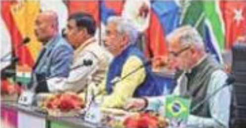
The Prime Minister addressed the meeting via video link from the Lal Bahadur Shastri auditorium in Varanasi.