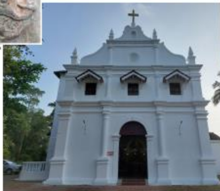
Goanska crkva São Brás, u prijevodu Sveti Blaž