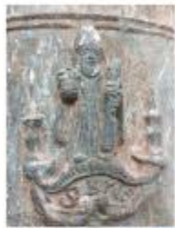
Sveat na zvonu crkve u Gandaulimu

procesiji, nosići svoj barjak. Goste iz Indije čekalo je u Dubrovniku i 36 tisuća američkih dolara. Do vrha puna kutija novca službeno im je predana u gradskome poglavarstvu. Toliki broj novčanica oni ipak nisu mogli fizički ponijeti sa sobom. Uplata prikupljene sume preko banke ili pošte također nije bila rješenje jer bi puni dolari morali biti pretvoreni u rupije, a onda opeoznani. Netko domisljat dosjetio se tada da se novac uplati na bankovni račun američkih isusovaca u Goi, koji ondje vode gimnaziju. I tako je nakon nepuna tri mjeseca stanja dolara u manjim svotama prikupljena pomoć u potpunosti pristigla u Gandaulim. Novca je bilo toliko da su u obnovu crkve Goanci mogli izgraditi i župni dvor. Svećenik je dotad, naime,