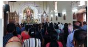
Noćeljina misa u crkvi São Brás

svaki dan pješalio 14 kilometara, po 7 u jednom smjeru, kako bi služio svetu misu. Obnovljeno je i grublje uz crkvu. Otada si stanovnici Gandaulima i Dubrovčani svake godine šalju brajave i moždašno čestitaju dan svetog Vlaha.