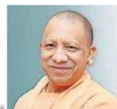
Premijer savezne države Uttar Pradesh Yogi Adityanath

Naime, prema izvještaju Grand View Researcha globalno tržište umjetne inteligencije doseglo je 136 milijardi američkih dolara u 2022. godini te se očekuje kako će do 2030. rasti po godišnjoj stopi od 37.3%, a investiranjem u projekt izgradnje prijestolnice umjetne inte-