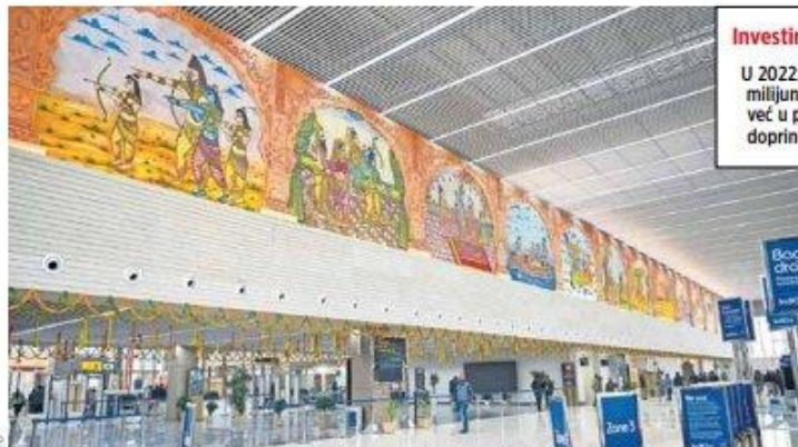
Nova međunarodna zračna luka Maharishi Valmiki otvorena 30. prosinca u Uttar Pradeshu savršeni je primjer uspješnog indijskog spajanja modernog s tradicionalnim

Uttar Pradesh, najmnogoljudnija indijska savezna država, brendirana je kao dom jedne od najljepših građevina na svijetu, Taj Mahala te Varanasi, duhovne prijestolnice Indije pa ni ne čudi njena popularnost među turistima, koja je nakratko pala jedino tijekom pandemije Covida-19 i sveopćeg zatvaranja. Danas ova država ponovno bilježi rekorde u turističkoj posjećenosti. U 2022. posjetilo ju je impresivnih 318.5 milijuna turista, a taj je broj oboren već u prvih devet mjeseci 2023. godine. Osim atraktivne turističke ponude, stručnjaci kažu da iza toga sto-