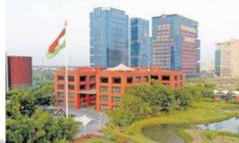
GIFT City je koncipiran na način da su svi sadržaji, kao što su škole, parkovi, klubovi i ostalo, nadohvat ruke, čime se značajno poboljšava kvaliteta života

"Indija napreduje u ulazi 'Vishwa Mitre' (globalnog prijatelja) u svijetu koji se mijenja velikom brzinom. Indija je svijetu dala povjerenje u postizanje zajedničkih ciljeva. Indijska posvećenost, trud i naporan rad za globalnu dobrobit čine svijet sigurnijim i naprednijim. Svijet gleda na Indiju kao na važan stup stabilnosti. Prijatelja kojem može vjerovati, partnera koji vjeruje u razvoj usmjeren na ljude, glas koji vjeruje u globalno dobro, pokretača rasta globalnog gospodarstva, tehnološko središte za pronalaženje rješenja, snagu talentirane mladeži i uspješnu demokraciju", rekao je premijer Narendra Modi prilikom otvaranja summita.