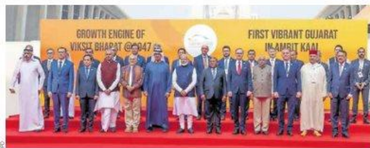
Pod motom "Vrata u budućnost", ovogodišnji je događaj okupio 34 partnerske države i 16 partnerskih organizacija

Navedene nove inicijative dodatno pozicioniraju Gujarat prema središnjem mjestu na međunarodnoj gospodarskoj pozornici te označavaju njegovu transformaciju u istaknuto globalno središte za nove i sektore u nastajanju.